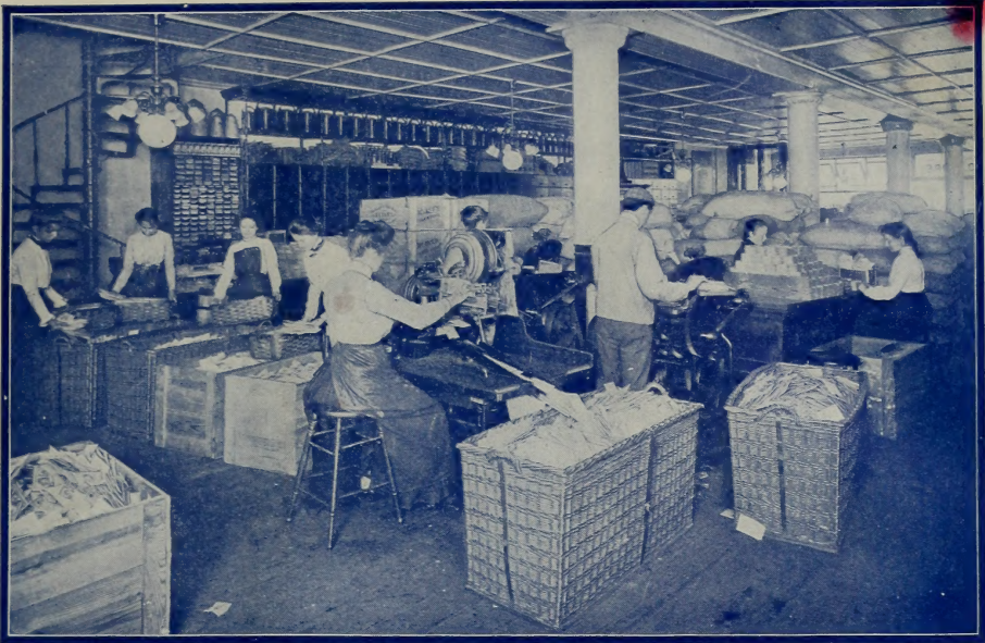
A View of Buist's Garden Seeds being put up in Packets by Electric Machinery which avoids all errors in either their Gauge or Variety.

BUIST'S SEEDS in packets are not commissioned, if they were they would very soon lose their established reputation for reliability. BUIST'S are of new crop each season. Commissioned Seeds may have been when first put up, but that may have been ages since.